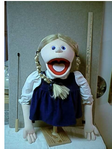
Bethany - New from www.puppetsinc.com - $160 We call her Becky.

Extras include 1 sweater, 1 shirt, 1 dress, 1 overalls, and disk & script for skit for Lord’s prayer (God talks back to her). Optional music disk extra: Music Machine: “The Majesty of God”.