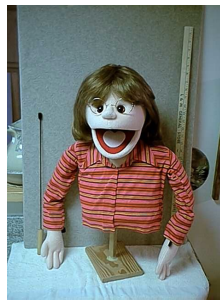
Gabrielle - New from www.puppetsinc.com - $160 We call her Sarah Seemore.

Extras include glasses, hairbrush, overalls, yellow vest, shirt, sweater, and disk of entrance music for “Sarah Seemore in the news”.