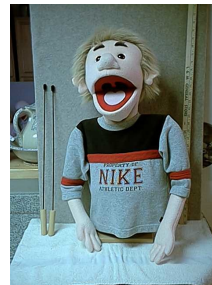
JT - New from www.puppetsinc.com - $160 We call him Caleb.

Extras include shirt, headset, overalls, and sunglasses.